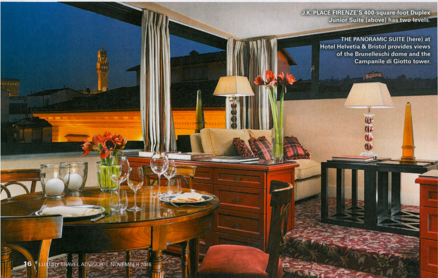
J.K. PLACE FIRENZE'S 400-square-foot Duplex Junior Suite (above) has two levels.

Room No. 301 is a 500-square-foot Classic Suite, which overlooks the Via dei Medici rather than the piazza. The living room is separate from the bedroom. A sofa bed can be provided in the living room upon request. The Suite also has a powder room in addition to a full bathroom with tub / shower. Moreover,